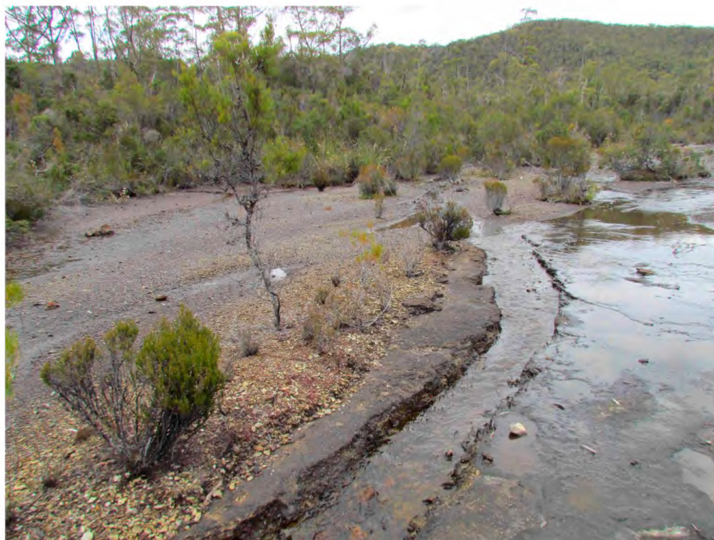
Fig. 4. Typical habitat of Euphrasia amplidens – an open sediment pan amongst otherwise dense scrubby eucalypt woodland.

applied to an area of land with high mineral potential or prospectivity and predominantly in a natural state. The purpose of such reserves is mineral exploration and development of mineral deposits, and the controlled use of other natural resources, while protecting and maintaining the natural and cultural values of that area of land.